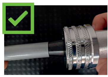
WARNING! The expander head should be inserted into the end of the pipe up to the stop.